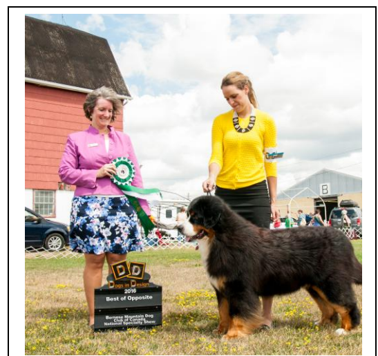
AM GCHB CAN CH Honeoye Arundel's Arm Candy "Derrick"